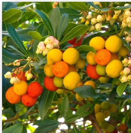
Fruits and flowers at the same time!

As flowering and fruit maturation occur in autumn, fruits will then take the whole year to ripen. The fruit is ripe in November/December and is about 15mm in diameter. When fully ripe it falls from the tree and so it is advisable to grow the plant in short grass in order to cushion the fall of the fruit, or pick them just in time (when they are a little bit overripe).